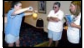
Conservation & Dehooking