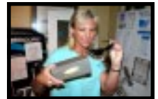
Deals on Fishing Stuff