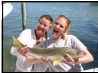
Fishing trip on Sunday! (additional to registration)